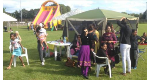
Live art sketches by Akinyemi Oludele