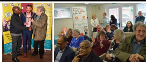
AGE-FRIENDLY WHALLEY RANGE & CHORLTON