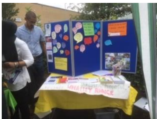
At Whalley Range Methodist Church