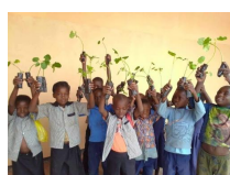
Malambayano High School Climate Change Club, Zambia