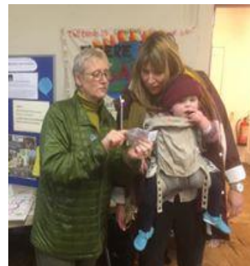
Linking with other areas- at Chorlton's Great Get Together

EcoFest is on Saturday May 2 nd at St Edmunds Church. The theme will be activism. Already lined up - the XR samba band, a talk from some people who have been on the protests, including one who was arrested, a talk about veganism, a workshop from a local zero waste shop. Whalley Range Climate Action group will be there!! If your group or organisation would like to offer a stall, workshop or talk, contact - revgracethomas@gmail.com