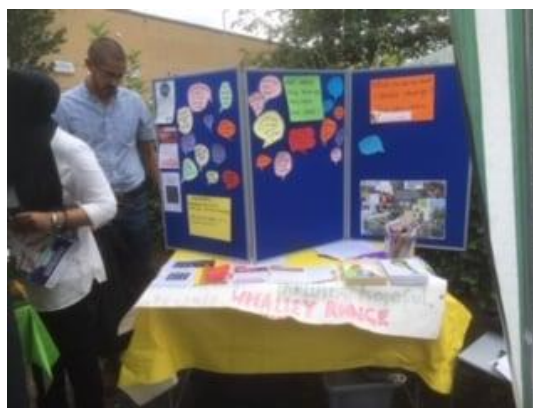
At Whalley Range Methodist Church