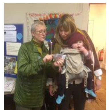
Linking with other areas- at Chorlton's Great Get Together