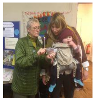
Linking with other areas- at Chorlton's Great Get Together

EcoFest is on Saturday May 2 nd at St Edmunds Church. The theme will be activism. Already lined up - the XR samba band, a talk from some people who have been on the protests, including one who was arrested, a talk about veganism, a workshop from a local zero waste shop. Whalley Range Climate Action group will be there!! If your group or organisation would like to offer a stall, workshop or talk, contact - revgracethomas@gmail.com