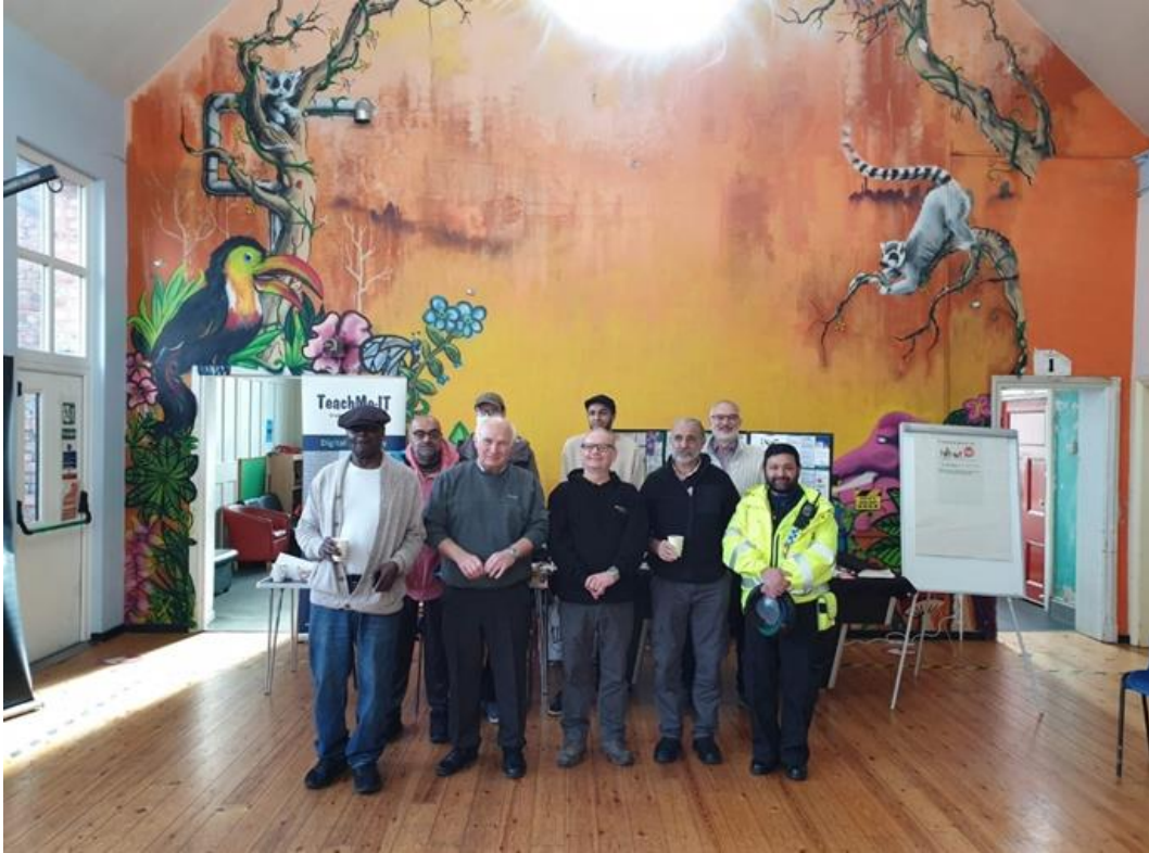
International Men's Day at JNR8