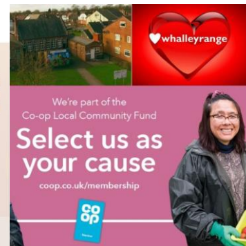
Co-op giant Cheque given to the WRCF as a Co-op Local Community Fund cause (funds raised in store)