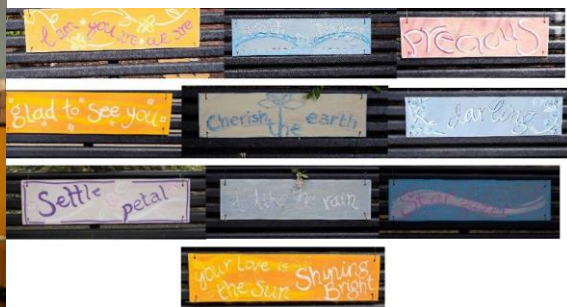
Age-friendly Celebrate bench signs