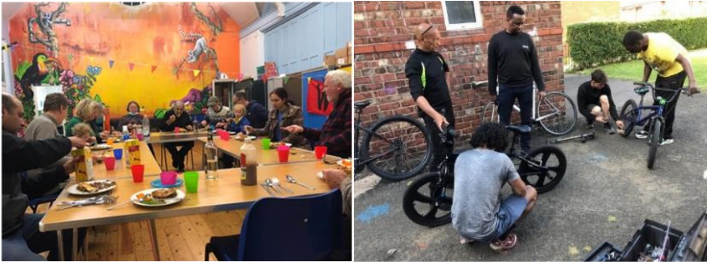
Time to Change Friday night freshly cooked meal together at JNR8/ Celebrate bike w/shop