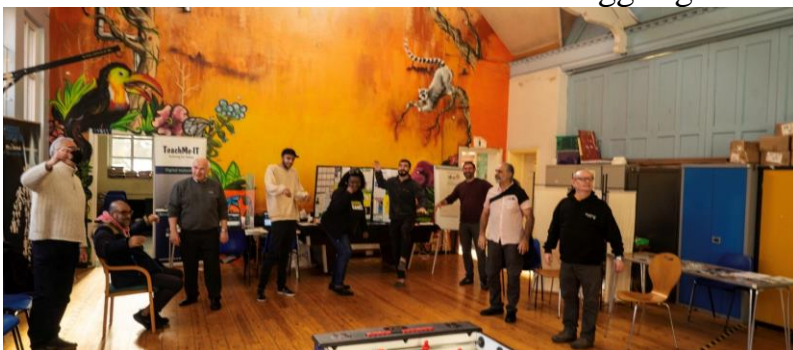
International Men's Day

We managed to stretch out our funding to provide over 400 packs – for older residents who usually attend our Festive Feasts, the older Asian men's group, Celebrate wellbeing packs, to people who attend our mental health and social groups - and people who receive support from other organisations e.g. homelessness charities, foodbanks and hot meal providers for residents in need. We also worked in partnership with Barakah Food Aid to give 6 x £100 Asda vouchers to families who were struggling financially over the festive season.